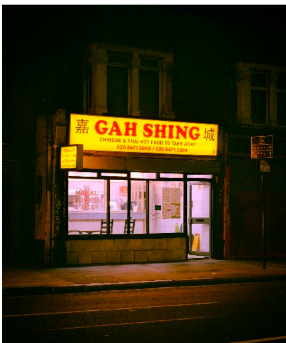
GAH SHING - East Ham, 2023