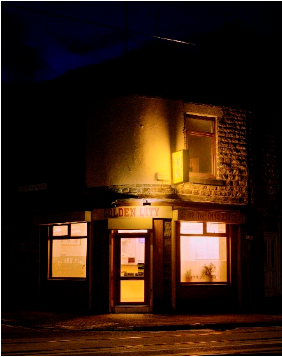
GOLDEN CITY - Hillsborough, 2024