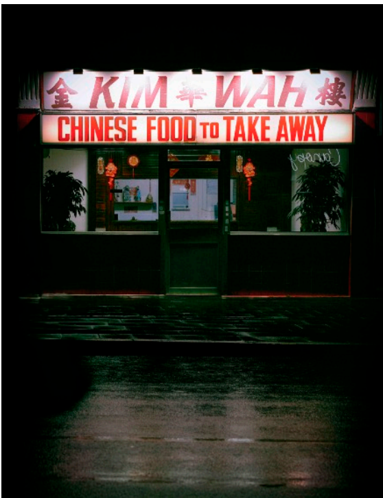
KIM WAH - Gants Hill, 2022