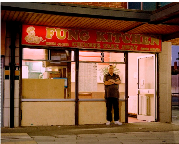
FUNG KITCHEN - Harlow, 2024