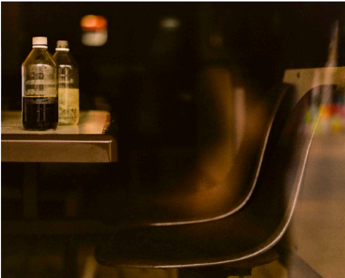
VINEGAR - East Ham, 2021