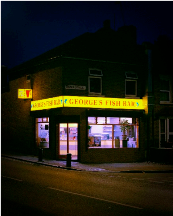
GEORGE'S FISH BAR - Plaistow, 2021