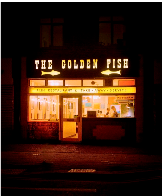
THE GOLDEN FISH - Dagenham, 2022