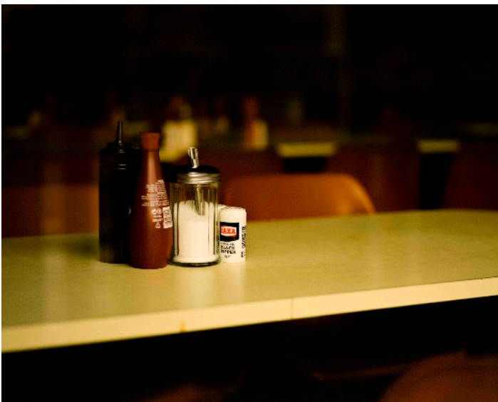
SALT 'N' VINEGAR - Sea Horse, East Ham, 2020