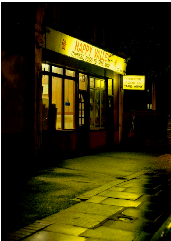
HAPPY VALLEY - Stoke Newington, 2023