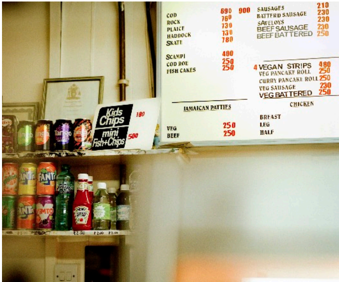
BONNERS MENU - Walthamstow, 2023