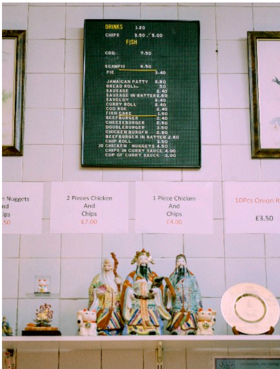
WELCOME INN MENU - Deptford, 2023