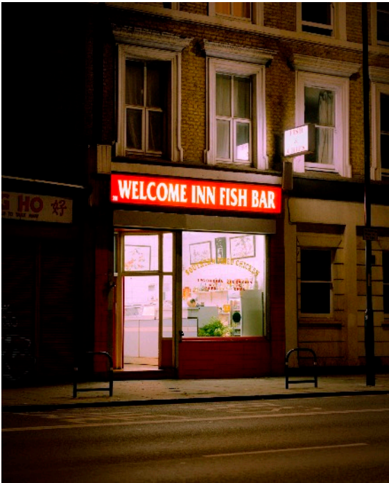
WELCOME INN FISH BAR - Deptford, 2023