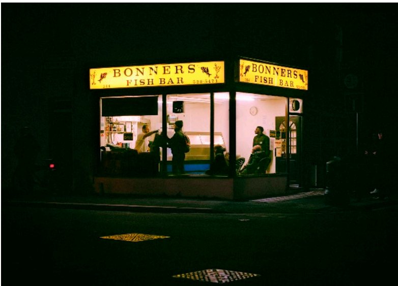
BONNERS - Walthamstow, 2022