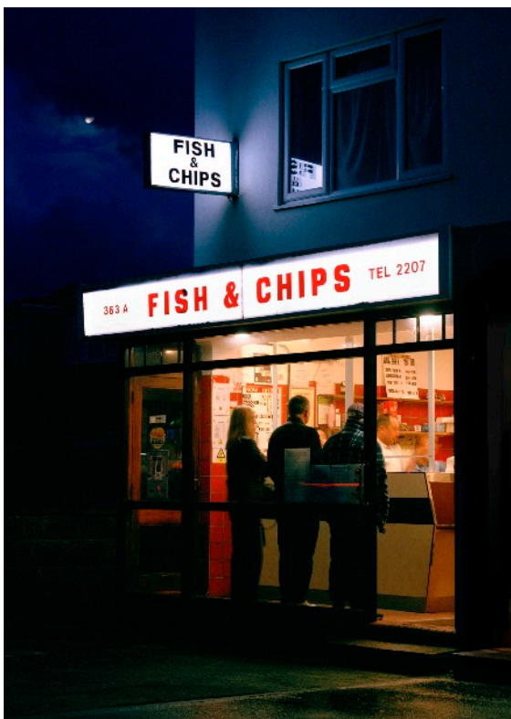
CENTRAL FISH & CHIPS - East Sussex, 2024