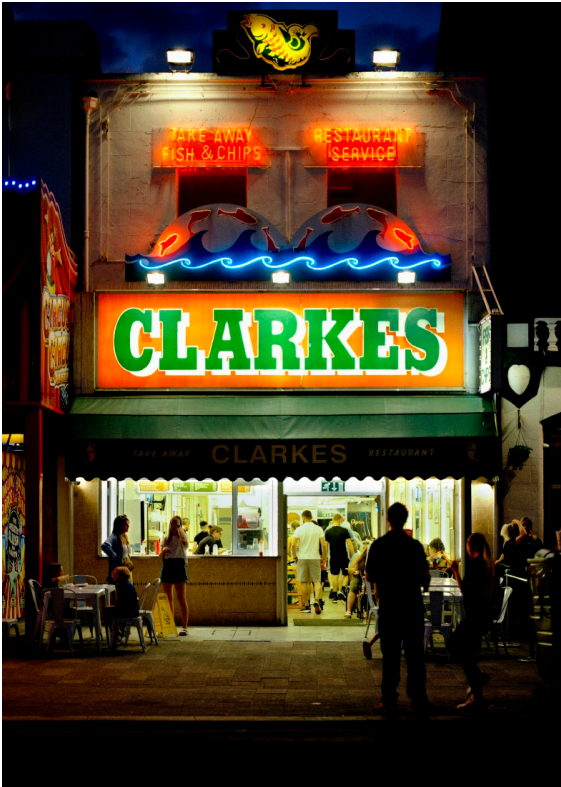
CLARKES - Southend, 2022