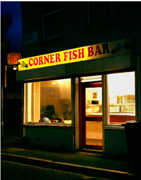
CORNER FISH BAR - Peckham, 2020