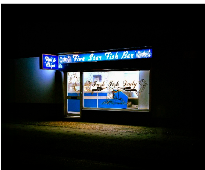
FIVE STAR FISH BAR - Collier Row, 2022