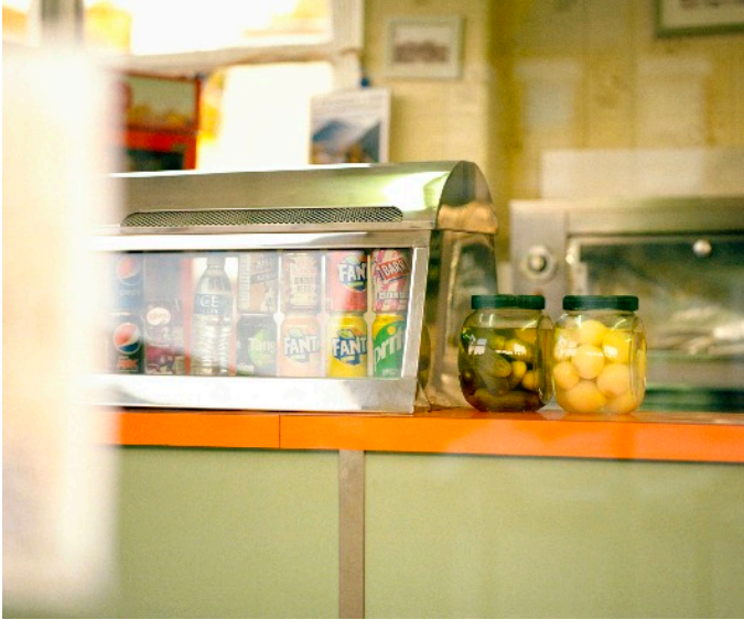
PICKLED GHERKINS AND EGGS - Crystal Palace, 2022