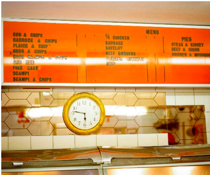
GOLDEN FISH BAR MENU - Wainscott, 2024