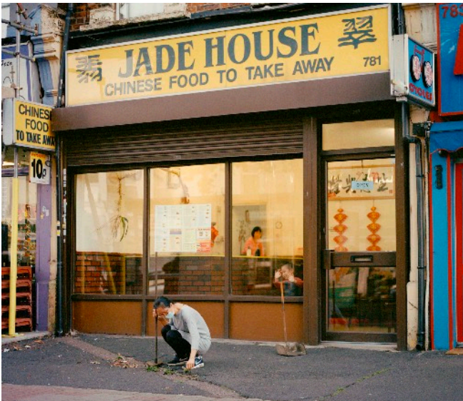
JADE HOUSE - Manor Park. 2020