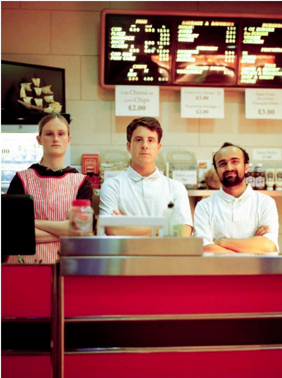
WALMER FISH & CHIPS - Walmer, 2024